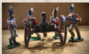
British 9 lb Cannon