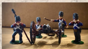
French 7 lb Cannon