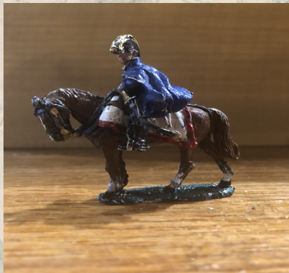
Duke of Wellington